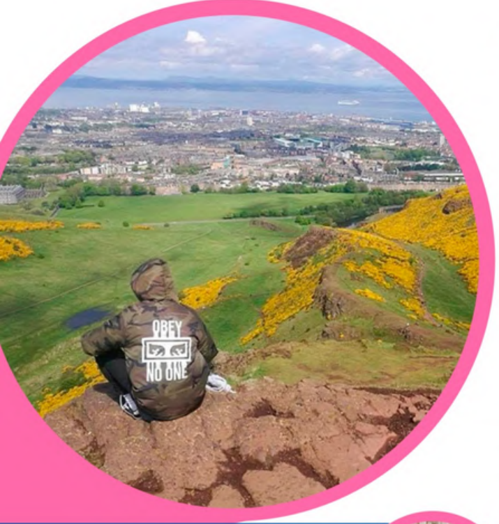
"I like the teacher and I enjoy the activities. The study at EEC will help me a lot to complete my degree in medicine next year."